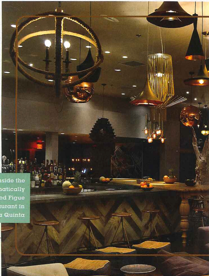
Inside the dramatically designed Figue restaurant in La Quinta